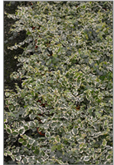
Variegated Creeping Fig in full