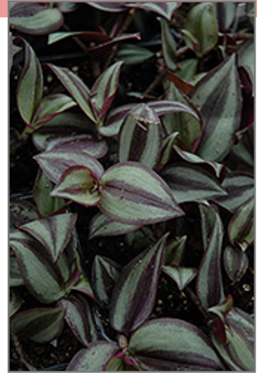
Wandering Jew foliage

When grown indoors, Wandering Jew can be expected to grow to be about 14 inches tall at maturity, with a spread of 14 inches. It grows at a fast rate, and under ideal conditions can be expected to live for approximately 10 years. This houseplant performs well in both bright or indirect sunlight and strong artificial light, and can therefore be situated in almost any well-lit room or location. It prefers to grow in average to moist soil. The surface of the soil shouldn't be allowed to dry out completely, and so you should expect to water this plant once and possibly even twice each week. Be aware that your particular watering schedule may vary depending on its location in the room, the pot size, plant size and other conditions; if in doubt, ask one of our experts in the store for advice. It is not particular as to soil type or pH; an average potting soil should work just fine.