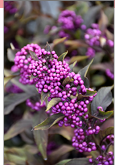
Pearl Glam Beautyberry fruit