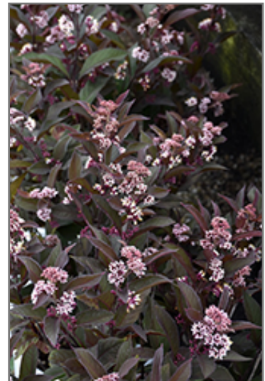
Pearl Glam Beautyberry flowers