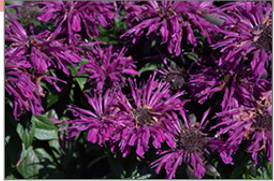
Rockin' Raspberry Beebalm flowers