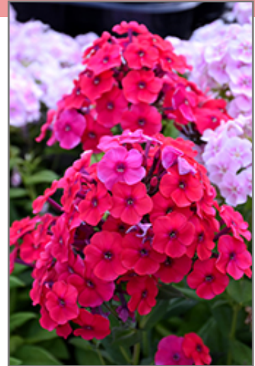
Red Riding Hood Garden Phlox flowers