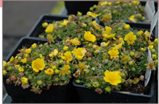
Alpine Cinquefoil flowers

Alpine Cinquefoil is recommended for the following landscape applications;