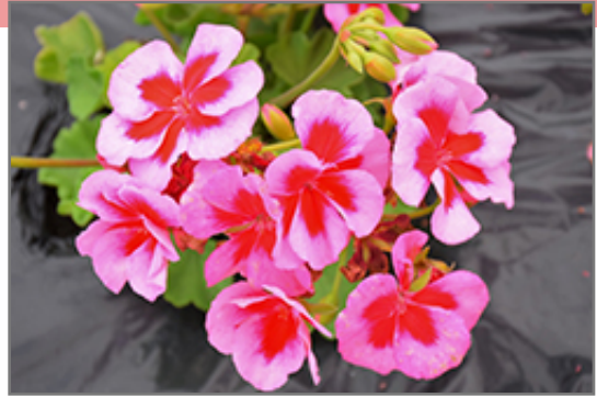
Calliope Large Rose Mega Splash Geranium flowers