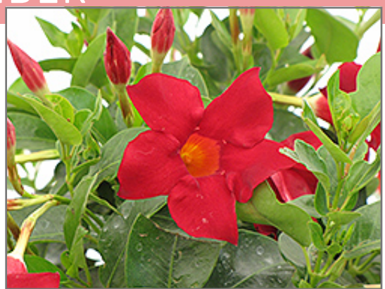
Madinia Deep Red Mandevilla flowers

This plant does best in full sun to partial shade. It requires an evenly moist well-drained soil for optimal growth. It is not particular as to soil type or pH. It is highly tolerant of urban pollution and will even thrive in inner city environments. This particular variety is an interspecific hybrid, and parts of it are known to be toxic to humans and animals, so care should be exercised in planting it around children and pets. It can be propagated by cuttings; however, as a cultivated variety, be aware that it may be subject to certain restrictions or prohibitions on propagation.