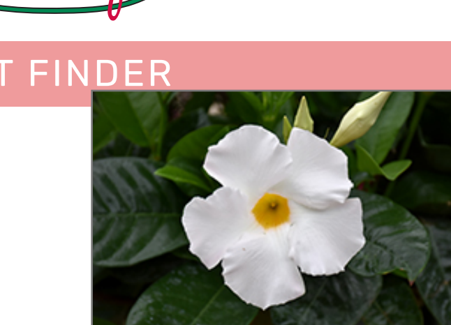
White Mandevilla flowers

This plant does best in full sun to partial shade. It requires an evenly moist well-drained soil for optimal growth. It is not particular as to soil type or pH. It is highly tolerant of urban pollution and will even thrive in inner city environments. This particular variety is an interspecific hybrid, and parts of it are known to be toxic to humans and animals, so care should be exercised in planting it around children and pets. It can be propagated by cuttings; however, as a cultivated variety, be aware that it may be subject to certain restrictions or prohibitions on propagation.