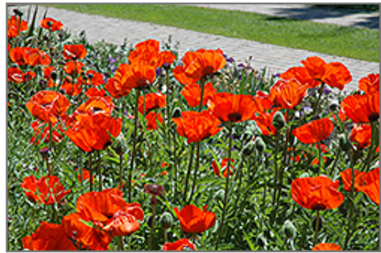
Brilliant Poppy flowers