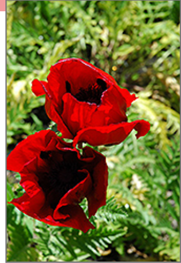
Brilliant Poppy flowers