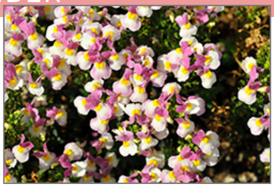
Escential Pinkberry Nemesia flowers