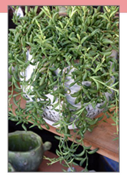
String of Bananas

An interesting trailing variety that is ideal for indoor containers, hanging baskets and rock gardens; featuring long strands full of glossy, banana shaped succulent foliage; easy to care for and low maintenance, perfect for beginners