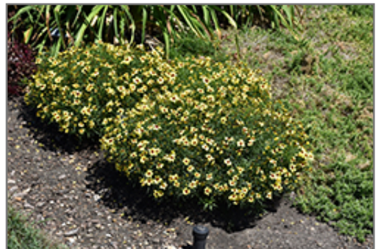
Sizzle And Spice Sassy Saffron Tickseed in bloom