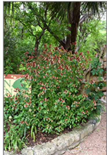
Fruit Cocktail Shrimp Plant in bloom