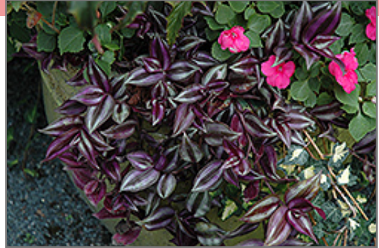
Burgundy Wandering Jew foliage