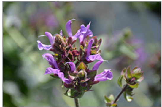
Lancelot Canary Island Sage flowers