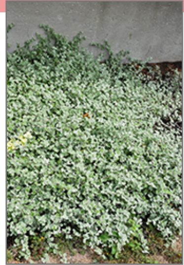
Silver Licorice Plant

Silver Licorice Plant is a fine choice for the garden, but it is also a good selection for planting in outdoor containers and hanging baskets. Because of its trailing habit of growth, it is ideally suited for use as a 'spiller' in the 'spiller-thriller-filler' container combination; plant it near the edges where it can spill gracefully over the pot. Note that when growing plants in outdoor containers and baskets, they may require more frequent waterings than they would in the yard or garden.