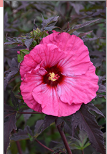
Inner Glow Hibiscus flowers