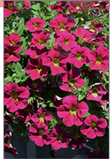
Capella Sangria Petunia flowers

Capella Sangria Petunia is recommended for the following landscape applications;