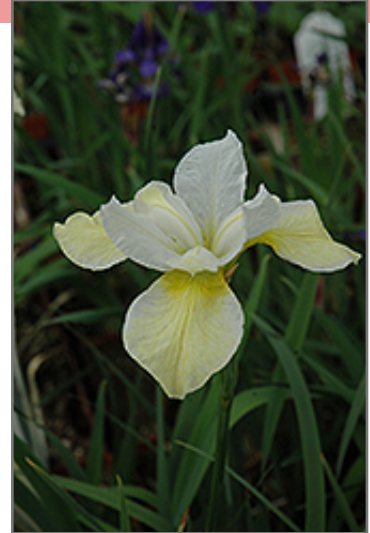
Butter And Sugar Siberian Iris flowers

Butter And Sugar Siberian Iris will grow to be about 22 inches tall at maturity, with a spread of 24 inches. When grown in masses or used as a bedding plant, individual plants should be spaced approximately 18 inches apart. It grows at a medium rate, and under ideal conditions can be expected to live for approximately 10 years. As an herbaceous perennial, this plant will usually die back to the crown each winter, and will regrow from the base each spring. Be careful not to disturb the crown in late winter when it may not be readily seen!