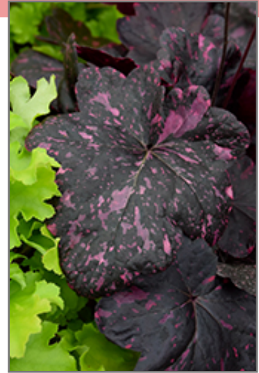
Midnight Rose Coral Bells foliage

Midnight Rose Coral Bells is recommended for the following landscape applications;