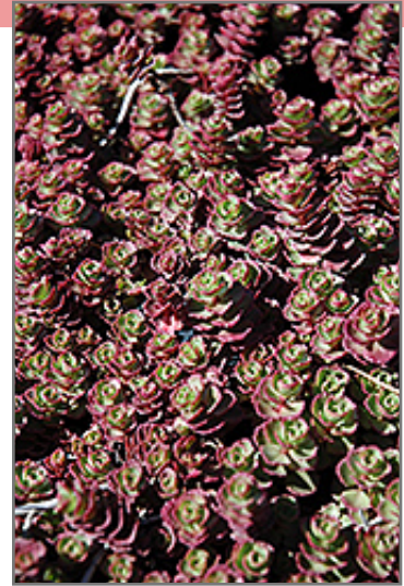
Red Carpet Stonecrop foliage

This plant will require occasional maintenance and upkeep, and is best cleaned up in early spring before it resumes active growth for the season. Deer don't particularly care for this plant and will usually leave it alone in favor of tastier treats. Gardeners should be aware of the following characteristic(s) that may warrant special consideration;