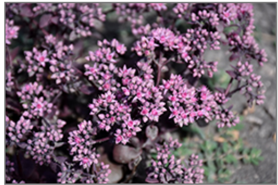
Red Carpet Stonecrop flowers