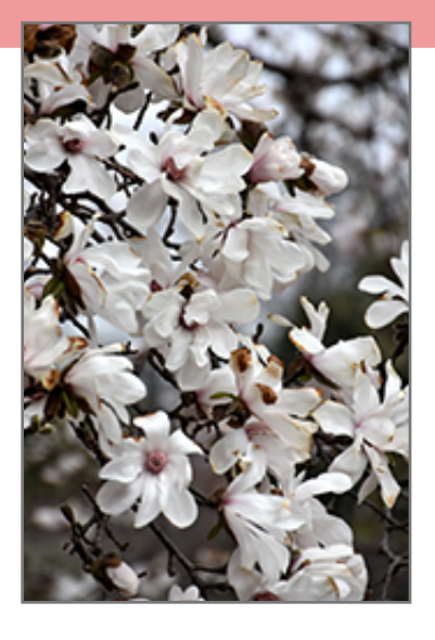
Merrill Magnolia flowers

This tree does best in full sun to partial shade. It requires an evenly moist well-drained soil for optimal growth, but will die in standing water. It is not particular as to soil type, but has a definite preference for acidic soils. It is quite intolerant of urban pollution, therefore inner city or urban streetside plantings are best avoided. Consider applying a thick mulch around the root zone in winter to protect it in exposed locations or colder microclimates. This particular variety is an interspecific hybrid.